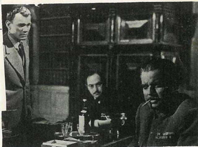
Journey into Fear