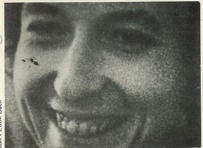
Don't Look Back

photographed by Oswald Morris, written by Truman Capote and produced by Jack Clayton POSTPONED FROM MARCH 11