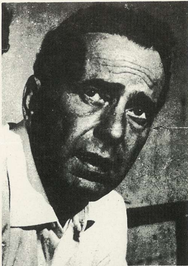
Beat the Devil

At 5.0 pm and 9.15 pm SAN FRANCISCO USA, 1936 115 mins