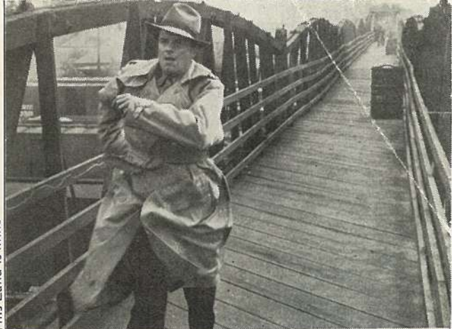
This Land is Mine