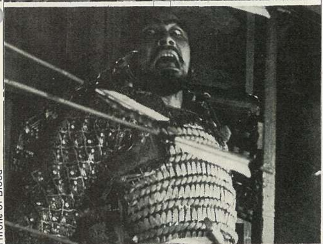
Throne of Blood