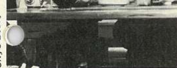
11.0 pm 7.0 pm

Monday April 26 at 7.0 pm Wednesday April 28 at 9.0 pm Friday April 30 at 9.0 pm Sunday May 2 at 5.0 pm and 9.0 pm