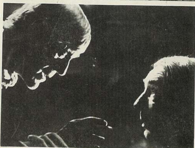
The Body Snatcher

Based on R L Stevenson's story of Edinburgh in the 1800's when grave-robbars supplied bodies for experiments by unscrupulous doctors. One of a series of films produced by Val Lewton, one of the few producers who have left their mark on the films for which they were responsible. "The Body