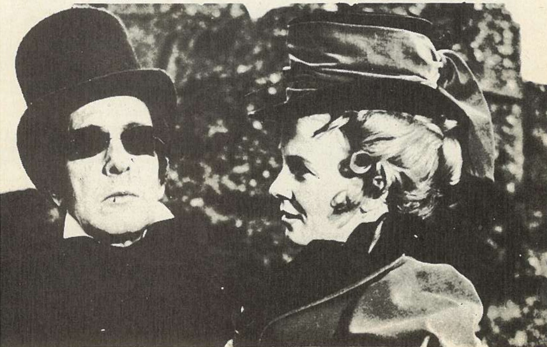
Tomb of Ligeia

Friday August 27 at 11.0 Saturday August 28 at 11.0