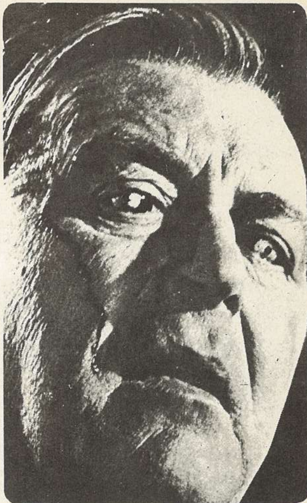
The Man With the X-Ray Eyes

Kubrick accurately described his film as a "nightmare comedy". Between two musical gags forming an overture and a coda, Kubrick orchestrates a whole series of hilarious variations on the "Balance of Terror"—swiping at a number of secondary, yet apt, targets as well