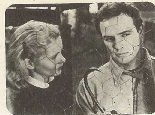
On the Waterfront