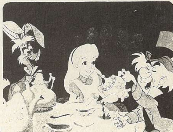
Alice in Wonderland