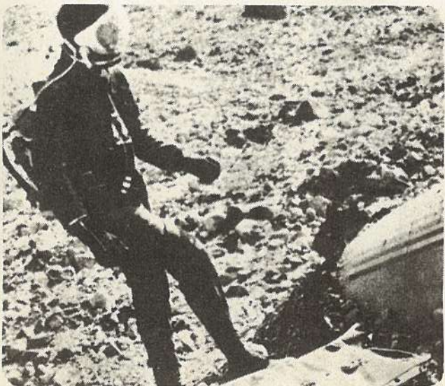
Robinson Crusoe on Mars

and ROBINSON CRUSOE ON MARS USA 1964 Colour Scope 85 mins Directed by BYRON HASKIN