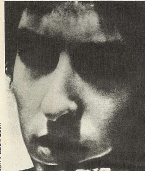
Don't Look Back

Directed by D A Pennebaker Canned Heat, Otis Redding, Jefferson Airplane, Janis Joplin, The Who, Country Joe, Jimi Hendrix, Ravi Shankar